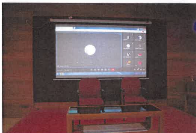
Guest Speaker while presenting the Screen