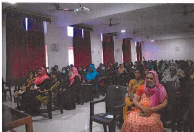
Students while attending the session in Seminar Hall

Principal PRINCIPAL AIMAN COLLEGE OF ARTS & SCIENCE FOR WOMEN TIRUCHIRAPPALLI-620 021